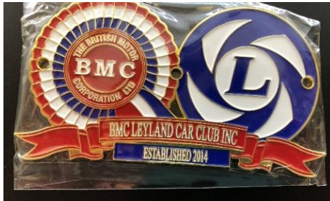
New Grille Badge