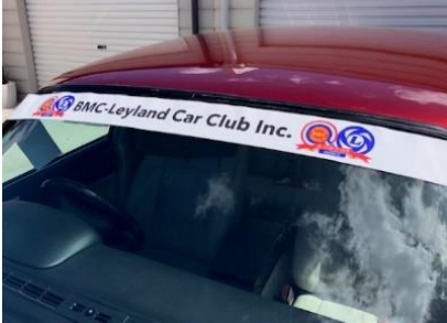
New Club Banner