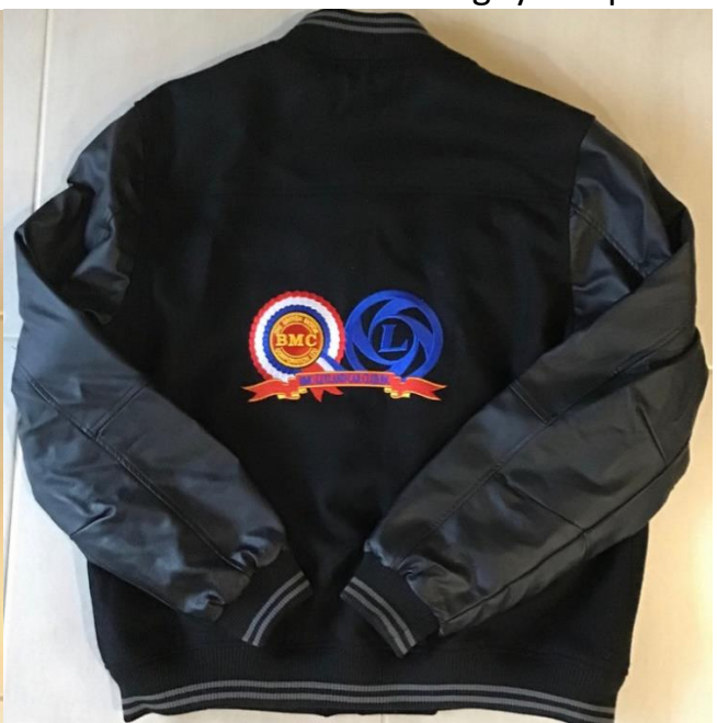
Leather Bomber Jacket