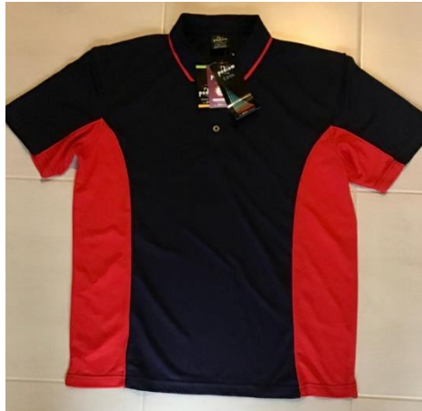
Club Polo Shirt