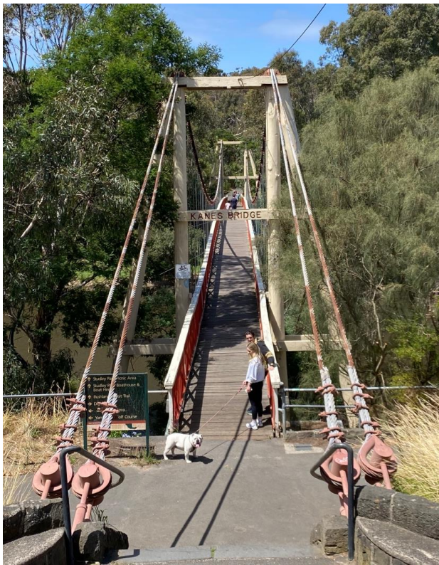
Historic Kane's Bridge

Members will meet at McDonald's, Kew, and drive through the picturesque suburb of Kew, and then along the historic Yarra Scenic Boulevard. The Run will end at the historic Studley Park Boathouse, where members are invited to have lunch. A couple of options are available: a BBQ/ picnic (the park has permanent BBQ facilities and several undercover picnic tables), or lunch in the newly refurbished Boathouse restaurant/ cafe.