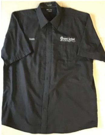
Club Dress Shirt