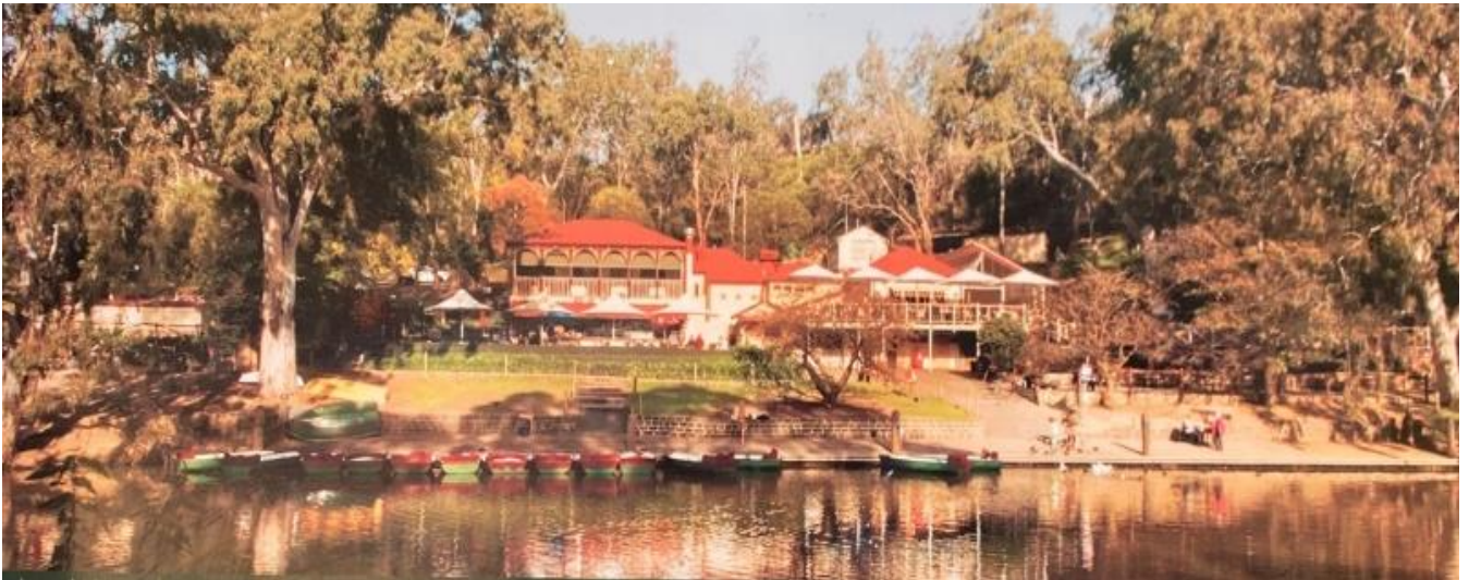
Studley Park Boathouse, by the Yarra River