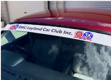
New Club Banner