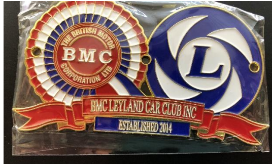
New Grille Badge