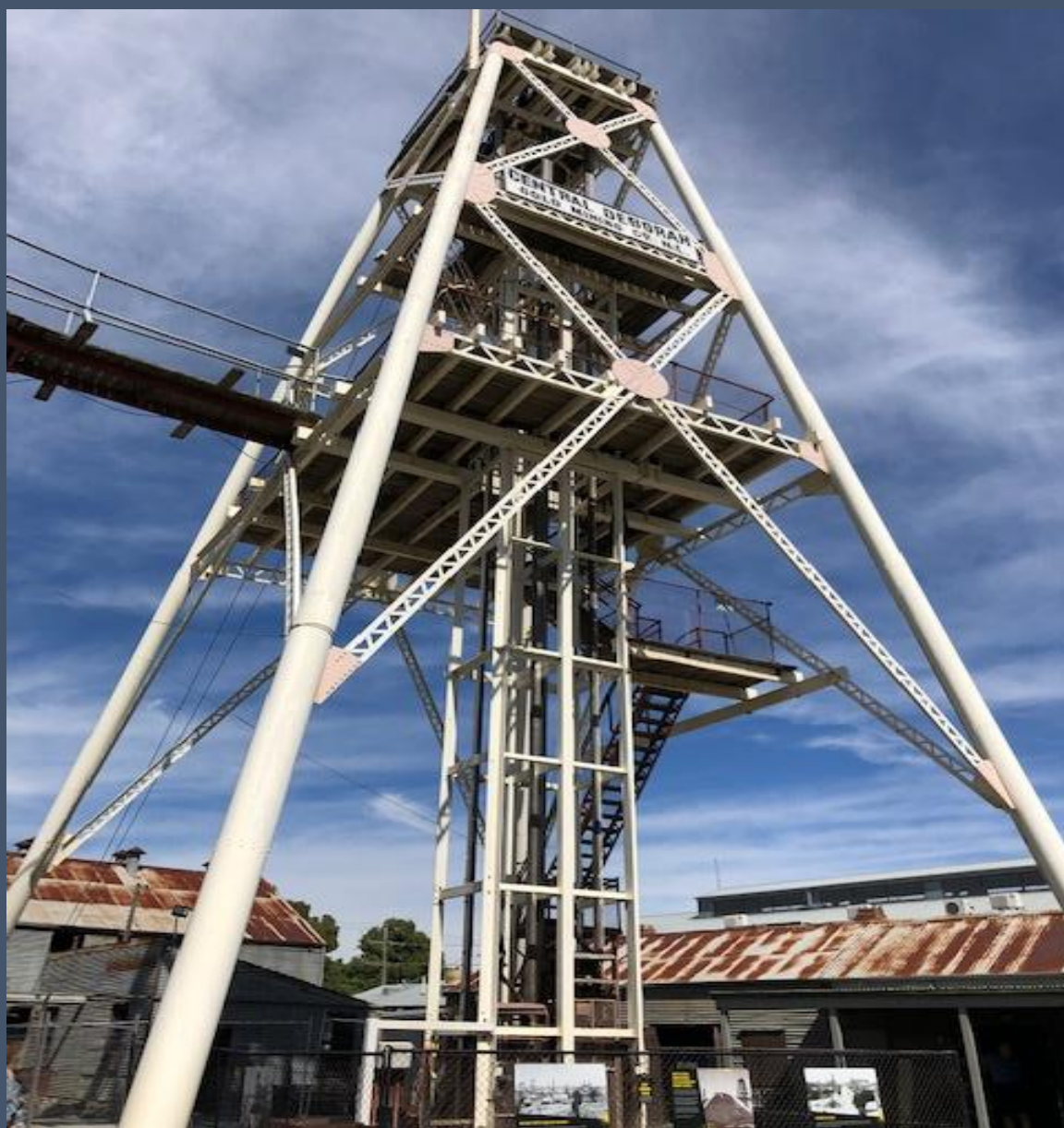
BENDIGO Centra Deborah Gold Mine.