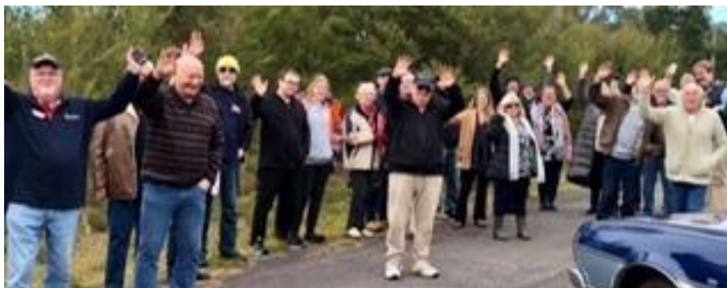
The backbone of the BMC-Leyland Car Club Inc, you, the members. Thank you.