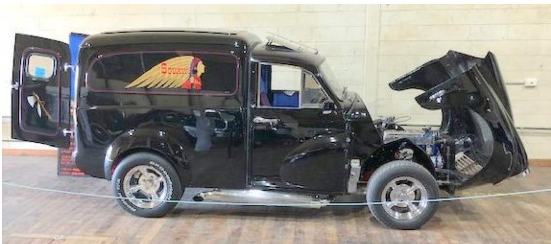
Now here is a van!