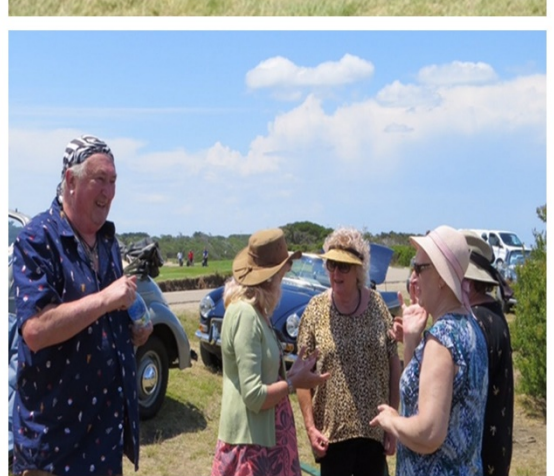
A good turnout on New Year's Day at Flinders.