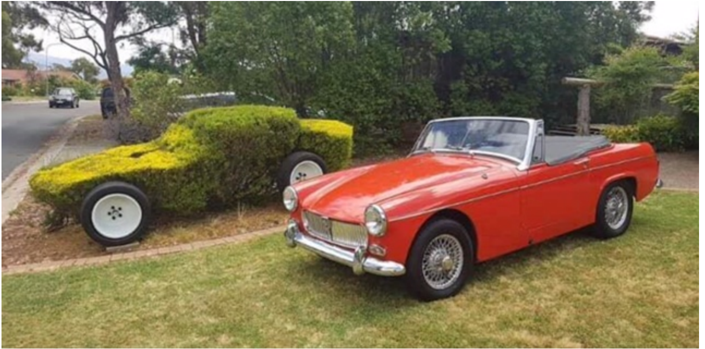
Someone has way too much time on their hands!