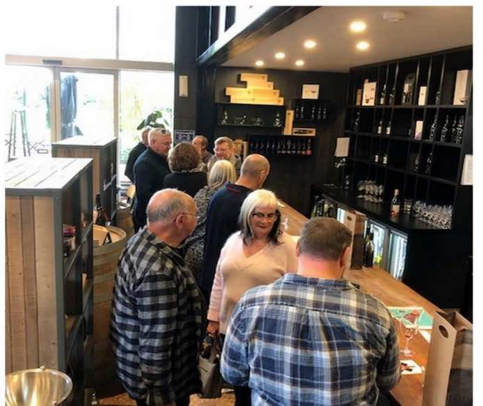
Wine tour members enjoying their tasting.