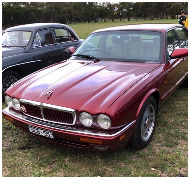
Some of the wine tour cars.