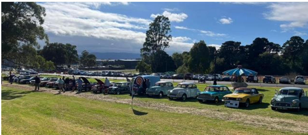
The line up of cars at the British Motoring Day at Caribbean Gardens.