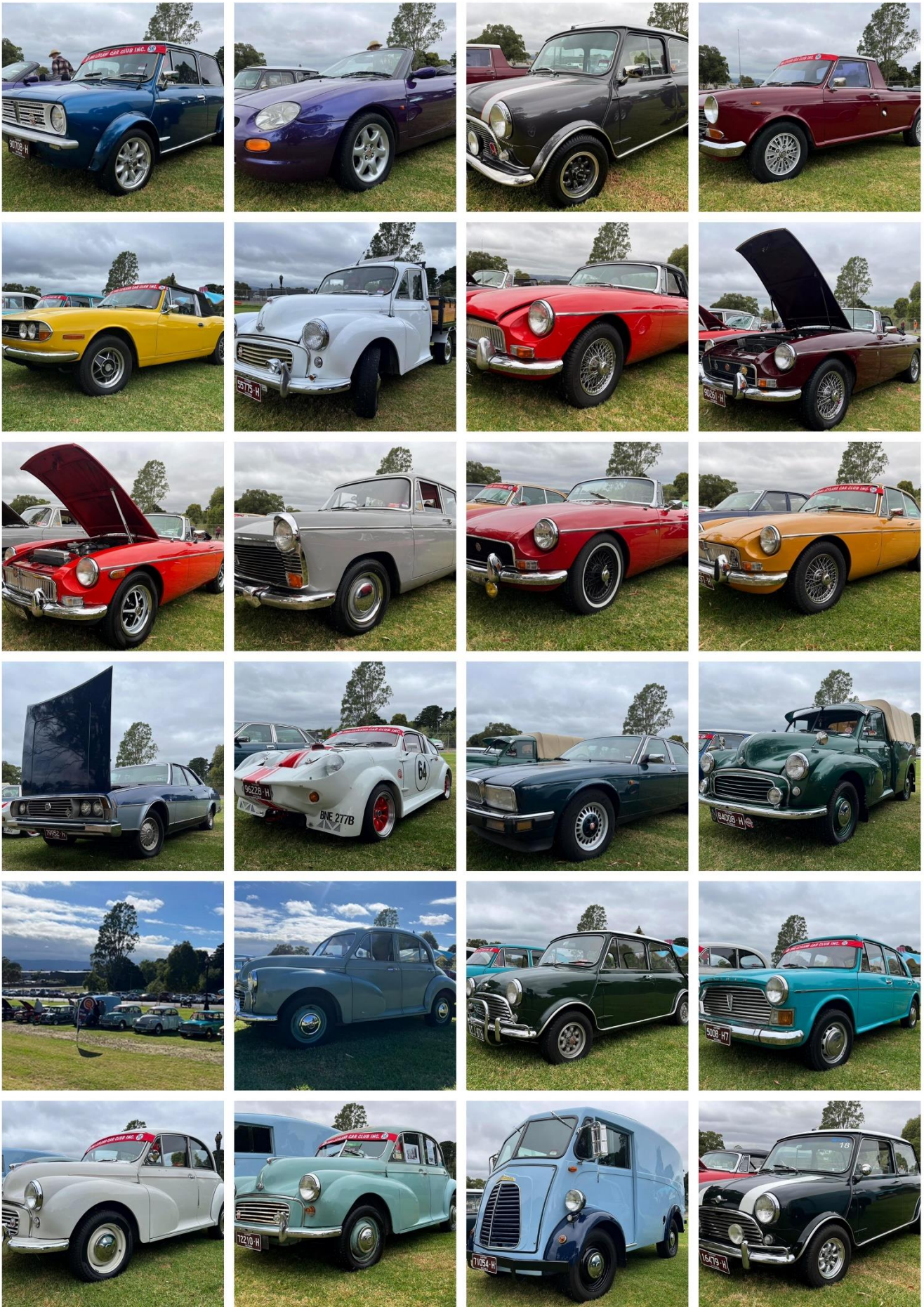
Club Cars at Caribbean Gardens British Motoring Show.