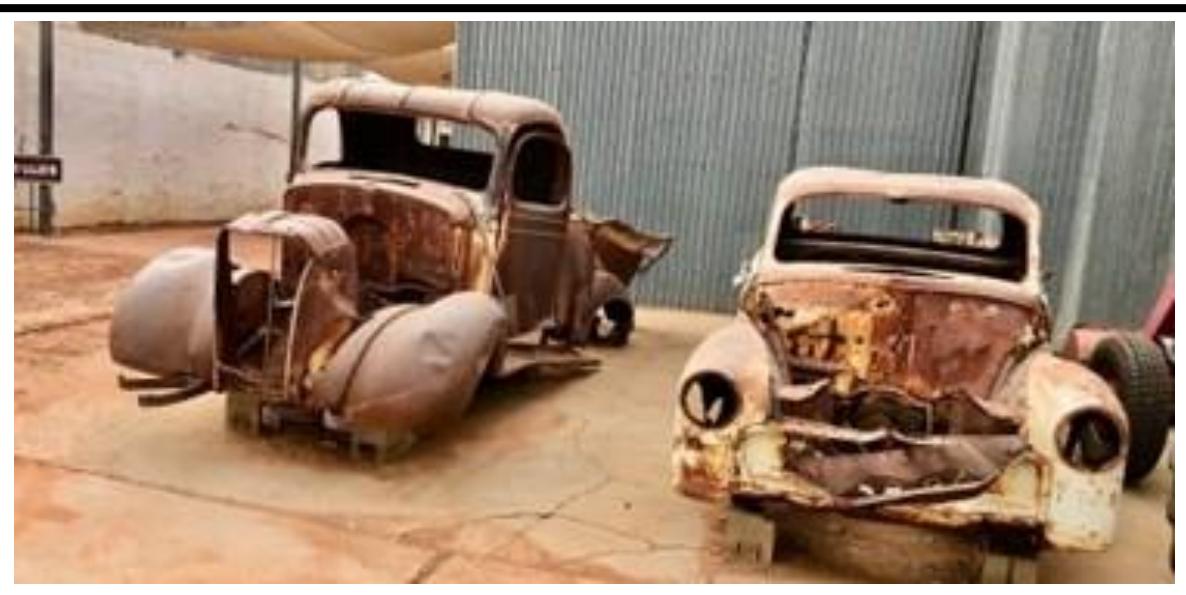
Only in the NT.