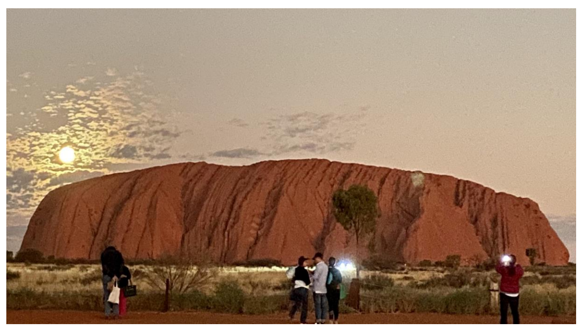
The "ROCK". A real highlight.