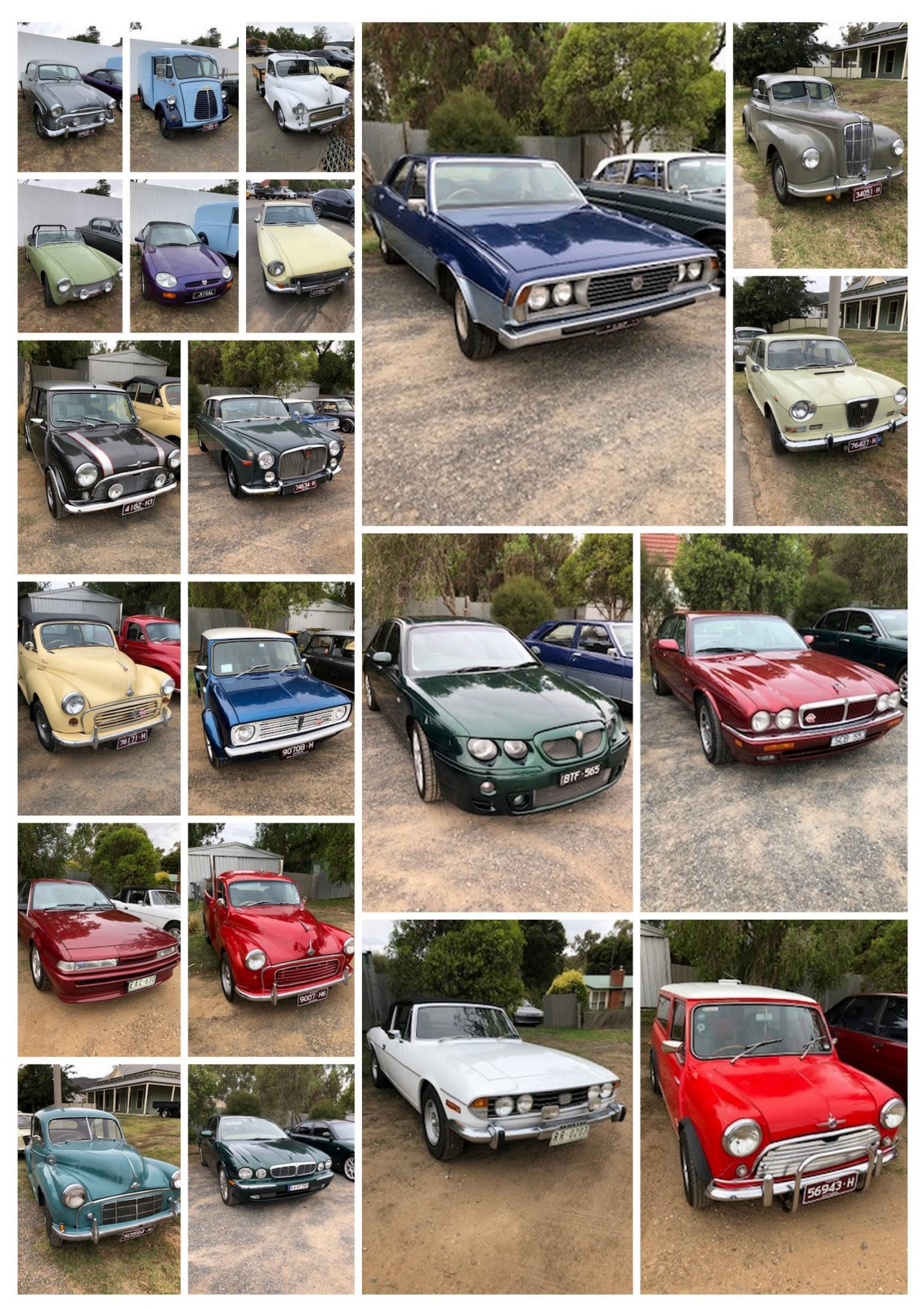
{\it Most\ of\ the\ many\ cars\ who\ came\ along\ to\ the\ Tallarook\ Hotel\ lunch\ run.}