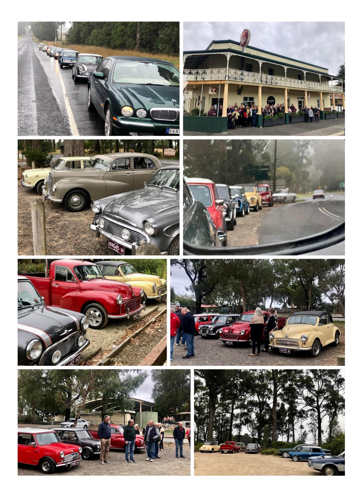
A great turnout of vehicles bought the town out at Tallarook.