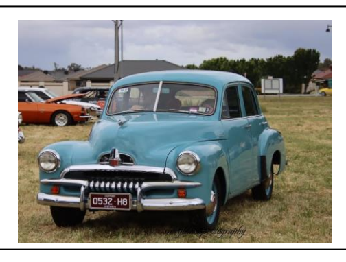
BMC CC Best Vintage 1927 Dodge