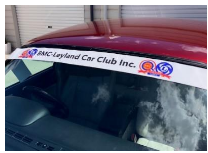
New Club Banner