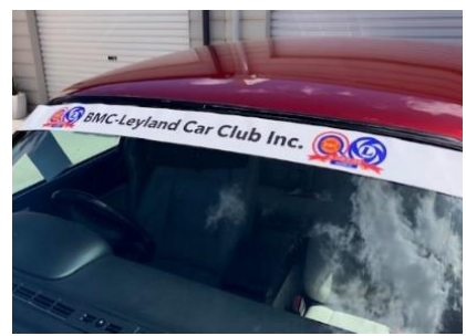
New Club Banner