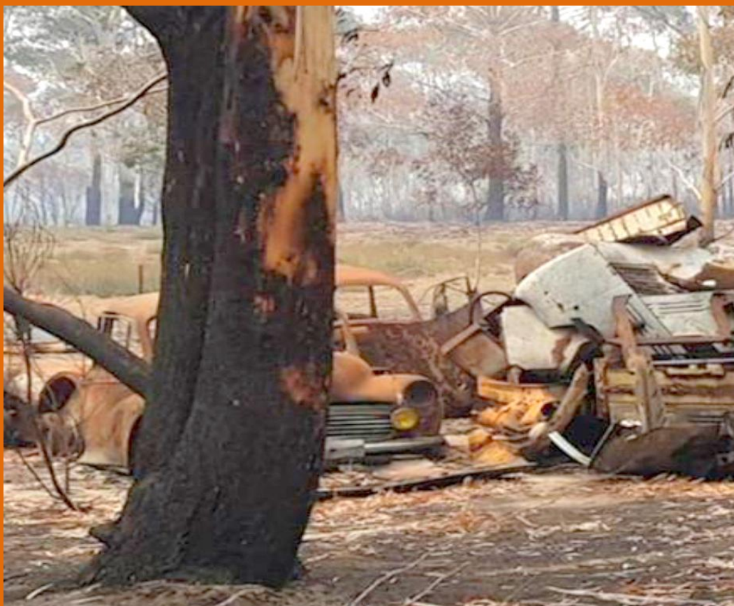
More pictures of the not so lucky cars caught in the New Year fires

The official publication of the BMC-Leyland Car Club Inc. Registered in Victoria.