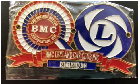
New Grille Badge