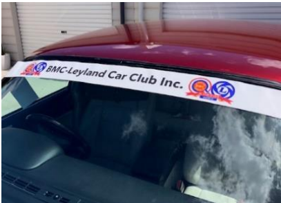
New Club Banner