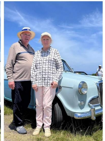
Some of the lucky members and their cars at New Years Day run to Flinders.