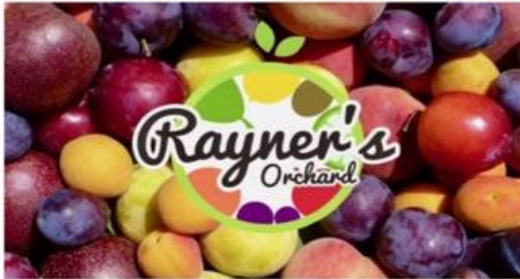
ORCHARD TOURS & U-PICK