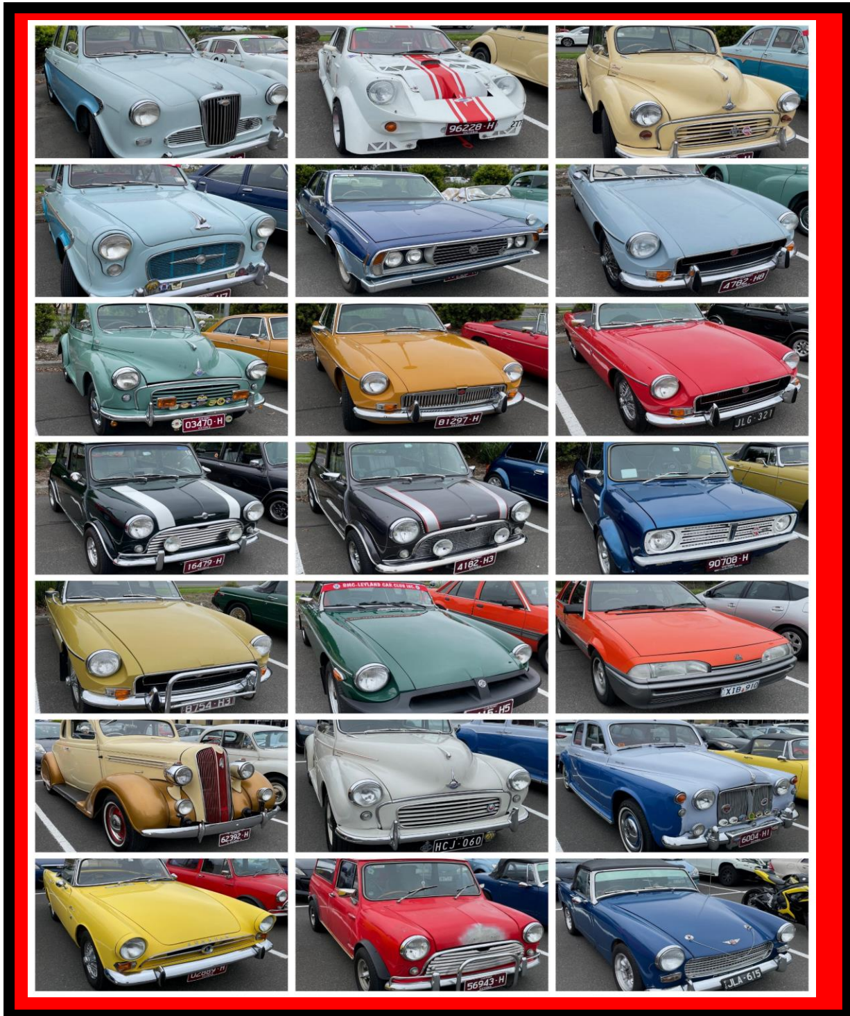
The cars at our Christmas Lunch Show and Shine.