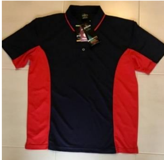
Club Polo Shirt