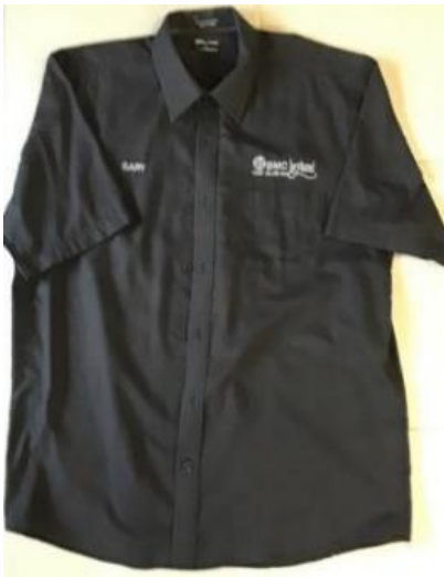
Club Dress Shirt