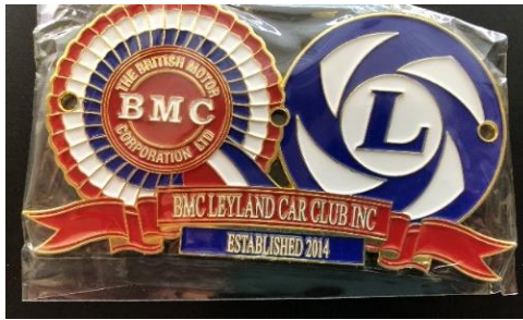
New Grille Badge