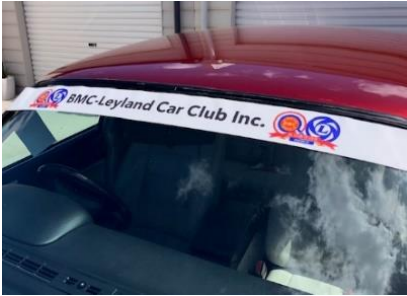
New Club Banner